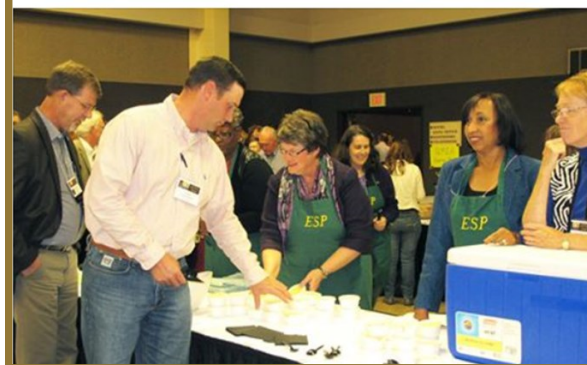
Missouri's Alpha Tau Chapter of Epsilon Sigma Phi-National Extension Fraternity hosts an annual ice cream social to recruit and retain members at our fall conference. The signature ice cream is Tiger Stripe!