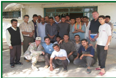
These are the future Aggies of Iraq.

At the end of the program, the members of the Ministry of Agriculture met with our training team and their Extension service to discuss future training programs. One of the programs they have requested is a lawn and landscape maintenance program for professionals. I am currently working on that project, and hope to go back there in the near future.