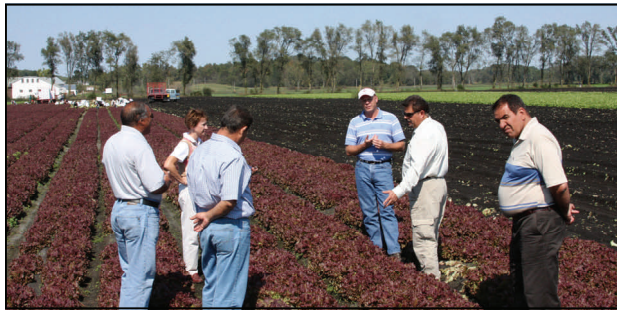
The Ohio Alpha Eta Chapter of ESP assisted with an agriculture tour by Iraqi visitors.

The tour occurred in September, and included visits to university research and extension sights, large and small farms, commercial businesses in the food chain, farmer’s markets and an endless exposure to new technology and new ways of thinking about running an agricultural system. The group was able to stay in individual homes one night of the tour and in a historic facility at the agricultural experiment station one night; while spending the majority of time with their host’s home as their base.